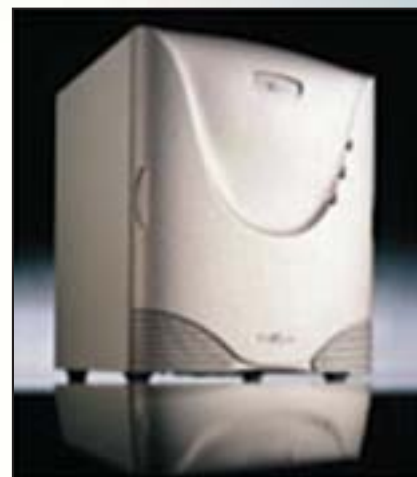
The Communication Solution for Small Businesses